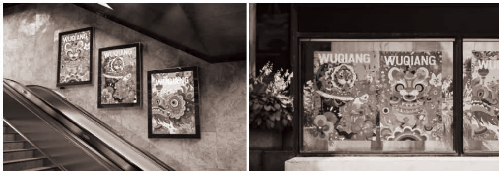
Fig. 7 AI-Generated Poster Featuring “Auspicious Patterns” Inspired by Wuqiang New Year Paintings

AIGC technology digitally analyzes and deeply