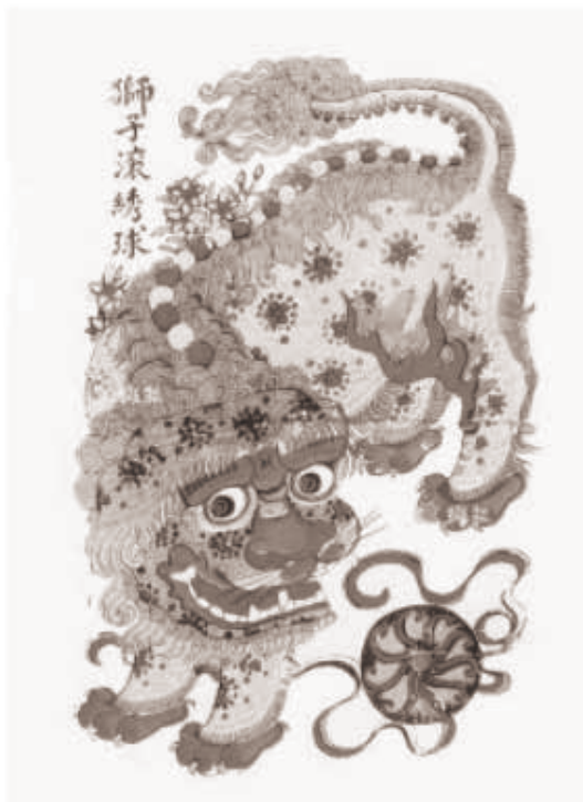
Fig. 3 “Lion Rolling the Embroidered Ball” in Wuqiang New Year Paintings

dominating the compositions. During field research at the Wuqiang New Year Painting Museum, the author learned about folk rhymes passed down through generations, including the saying, “To convey joy, use red and green.” This strong contrast of complementary colors caters to festive atmospheres, enhancing the visual impact and decorative effect. For example, in New Year paintings displayed during the Spring Festival, red symbolizes joy and warmth, while yellow represents wealth and prosperity. Together, these colors convey a strong sense