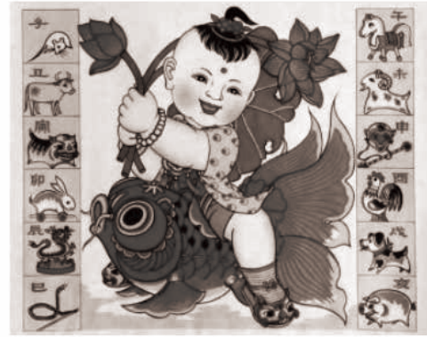
Fig. 5 The "Abundance Year After Year" in Wuqiang New Year Paintings

has led to differences in value systems between tradition and modernity. Wuqiang New Year paintings are characterized by vivid colors, full compositions, and simple themes. However, modern aesthetics tend to favor simplicity, abstraction, and minimalism, reducing the appeal of traditional forms among younger generations. Furthermore, the reinterpretation and redefinition of traditional cultural symbols highlight this identity deviation. The folk elements and ethical concepts embodied in Wuqiang New Year paintings are often assigned new meanings in contemporary contexts. For example, auspicious animals or folk story motifs that once represented collective emotional expressions within specific cultural backgrounds are now often simplified into decorative symbols. This semantic shift weakens the paintings' role as cultural carriers and may lead to misunderstandings or neglect their intrinsic value.