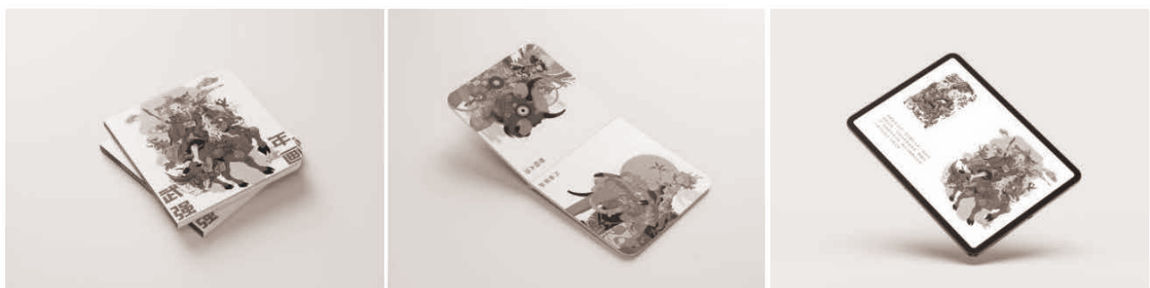
Fig. 8 AI-Generated Picture Book Illustrations of “Kylin Delivering a Son” and “Renewal of All Things” Combined with Wuqiang New Year Paintings