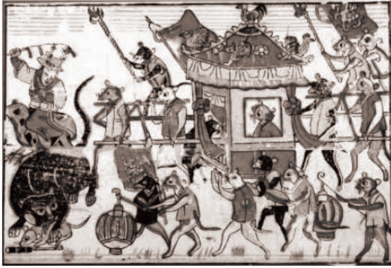
Fig. 4 The "Marriage of Mice" in Wuqiang New Year Paintings