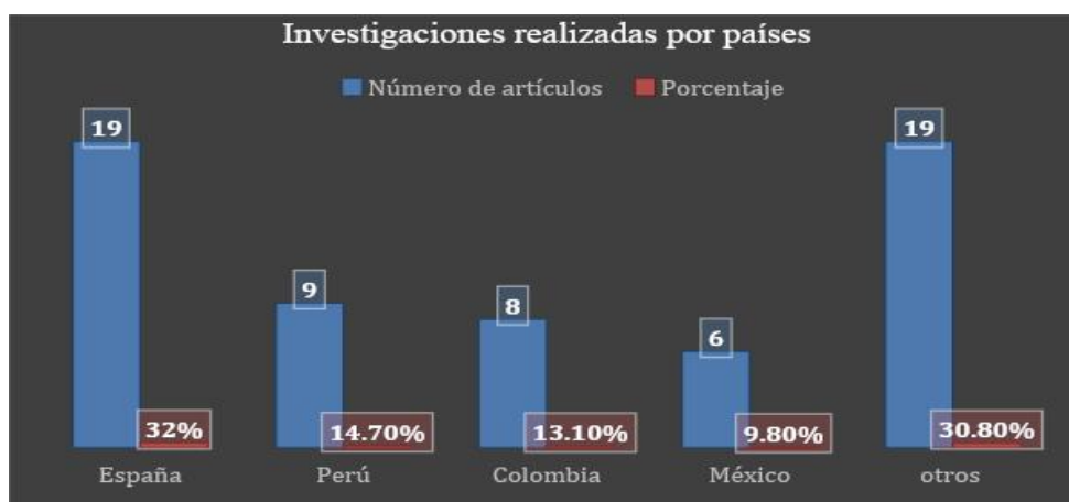
Figure 3. Research conducted by country.

Table 3 and Figure 3 show the research carried out by country and percentages.