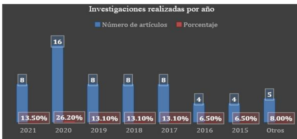
Figure 4. Investigations carried out per year.

Table 4 and Figure 4 show the number of articles included from 2011 to 2020. Therefore, a sample of 32 research articles is taken where